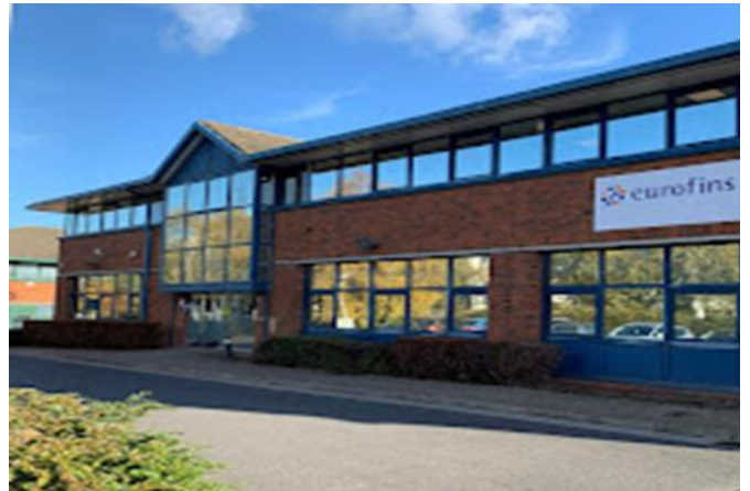
Units 3 & 6 Sandyford Business Park Acquired

Office investment and redevelopment opportunity