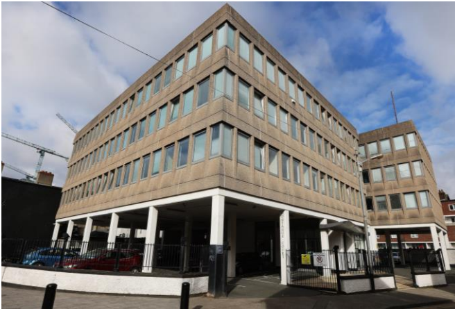
Montague Court Sold

Site for new winter sports arena with 8,000 person capacity