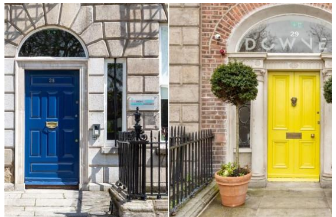
Merrion Square Portfolio

Acquisition of a recently refurbished and upgraded 40,000 sq ft prime Dublin 4 office