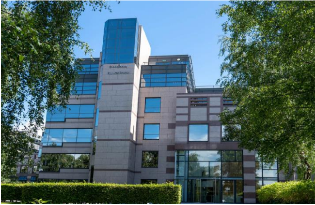
2 Ballsbridge Park Acquired

Client: Landfair / Arran Street Lot Size €18m