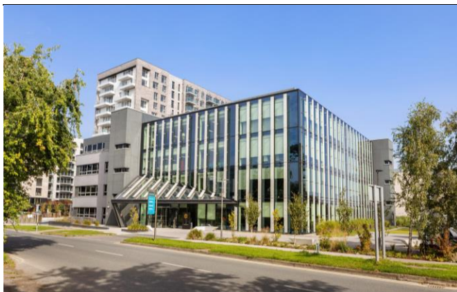
The Hive, Sandyford

Two Georgian buildings on a leading Dublin square