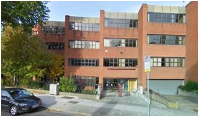
One Haddington Buildings, Haddington Road, Dublin 4