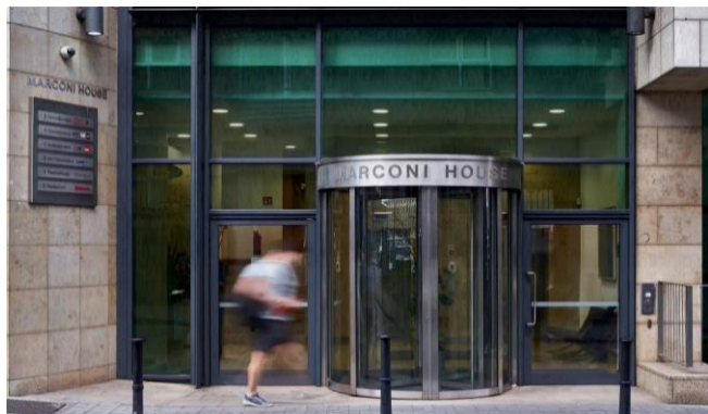
Ground, First & Second Floors Marconi House, Digges Lane, Dublin 2