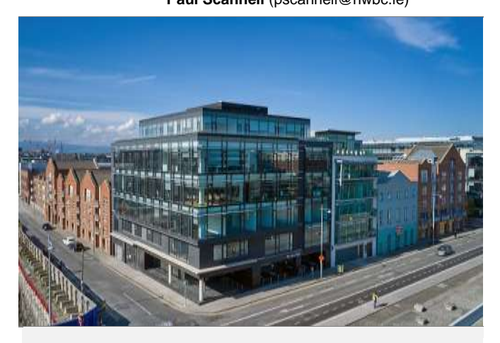
1<sup>st</sup> & 2<sup>nd</sup> Floors The Anchorage, Sir John Rogersons Quay, Dublin 2