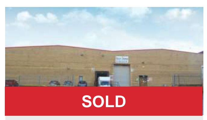
Units 13 & 14, East Coast Business Park, Drogheda, Co. Louth