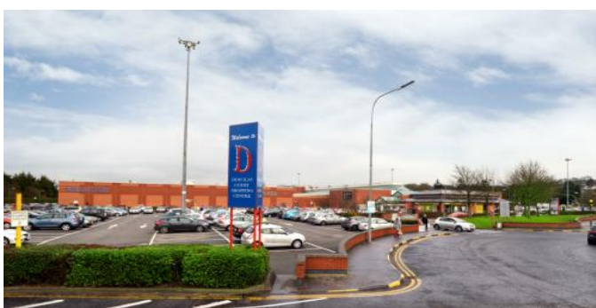
Douglas Court Shopping Centre, Douglas, Co. Cork