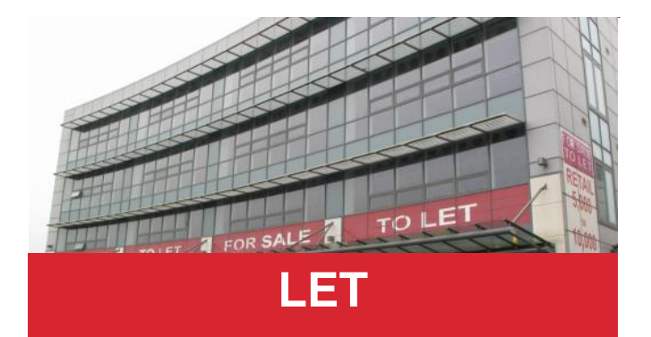
1<sup>st</sup>, 2<sup>nd</sup> & 3<sup>rd</sup> Floors, Park House, Blackpool Retail Park, Co. Cork

Rent/Sale Rent on Application Parking Available Status Available Contact Emma Murphy (emurphy@hwbc.ie)