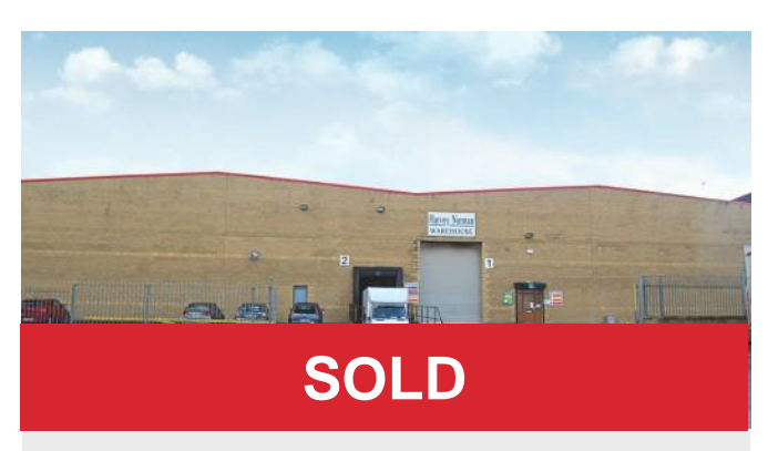
Units 13 & 14, East Coast Business Park, Drogheda, Co. Louth