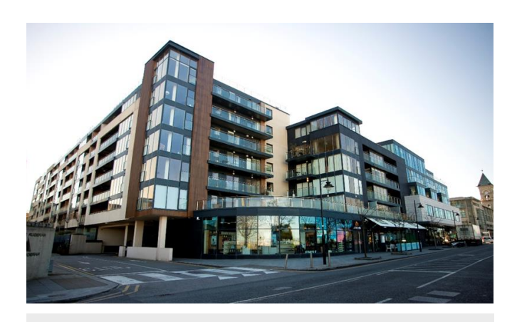
Unit 4, Crofton Road, Dun Laoghaire, Co. Dublin