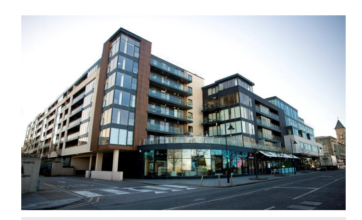
Unit 4, Crofton Road, Dun Laoghaire, Co. Dublin