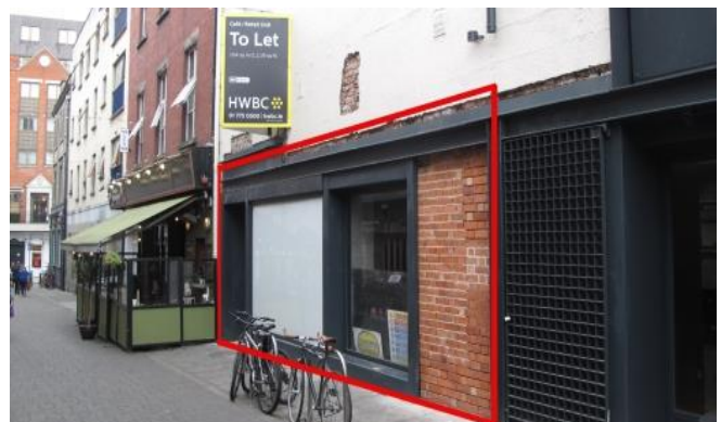
City Assembly House, Coppinger Row, Dublin 2