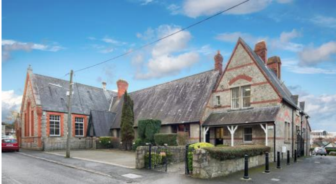
The Taney Buildings, Eglinton Terrace, Upper Kilmacud Road, Dublin 14