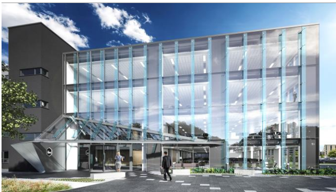
The HIVE Sandyford, Carmanhall Road, Dublin 18.