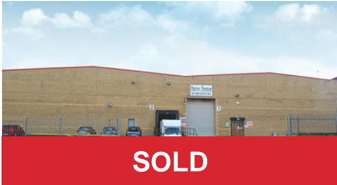
Units 13 & 14, East Coast Business Park, Drogheda, Co. Louth