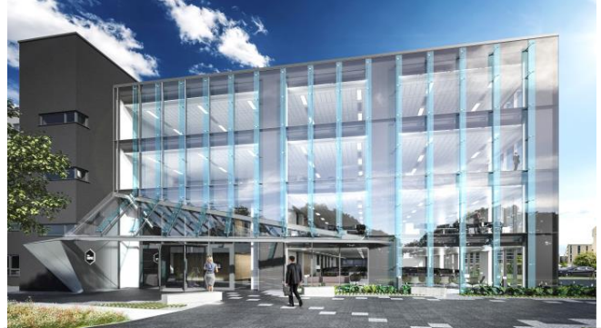
The HIVE Sandyford, Carmanhall Road, Dublin 18