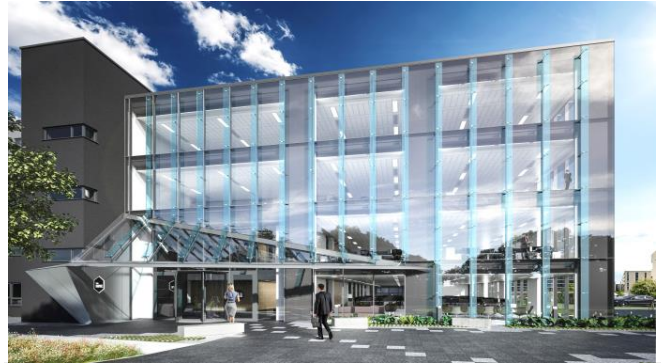
The HIVE Sandyford, Carmanhall Road, Dublin 18