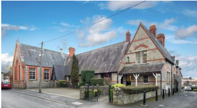
The Taney Buildings, Eglinton Terrace, Upper Kilmacud Road, Dublin 14