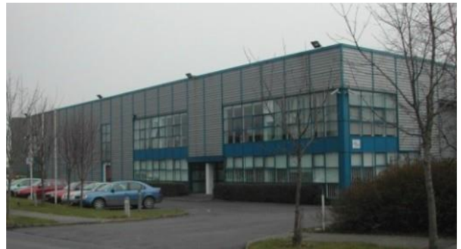
Units 1-4, 77 Furze Road, Sandyford, Dublin 18

Size/Lease Unit 1: 9,327 sq ft Unit 2: 4,284 sq ft Unit 3: 4,170 sq ft Unit 4: 4,332 sq ft