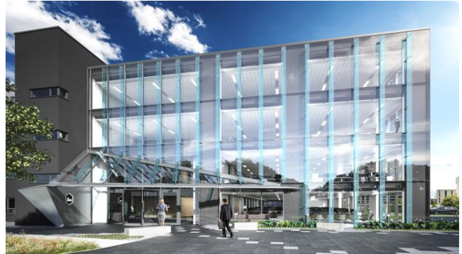
The HIVE Sandyford, Carmanhall Road, Dublin 18