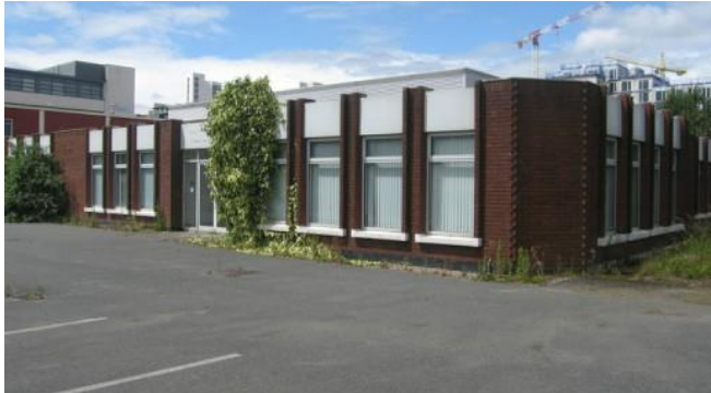
Former Siemens Unit, Ballymoss Road, Sandyford, Dublin 18