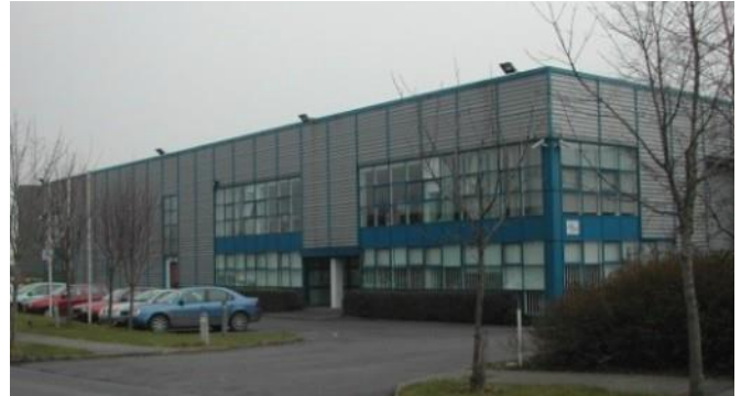
Units 1-4, 77 Furze Road, Sandyford, Dublin 18

Size/Lease Unit 1: 9,327 sq ft Unit 2: 4,284 sq ft Unit 3: 4,170 sq ft Unit 4: 4,332 sq ft