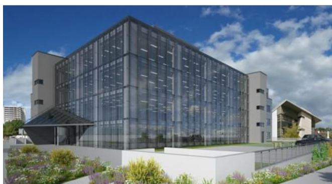
Ballymoss House, Ballymoss Road, Sandyford, Dublin 18