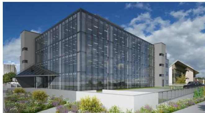
Ballymoss House, Ballymoss Road, Sandyford, Dublin 18