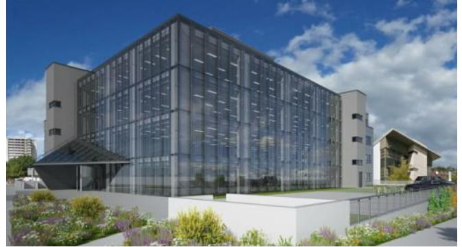
Ballymoss House, Ballymoss Road, Sandyford, Dublin 18