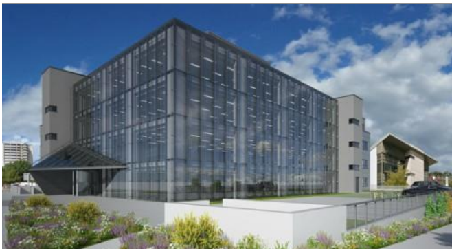
Ballymoss House, Ballymoss Road, Sandyford, Dublin 18