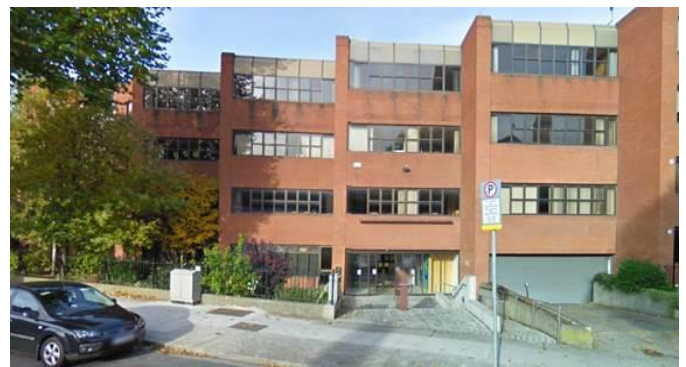
One Haddington Buildings, Haddington Road, Dublin 4