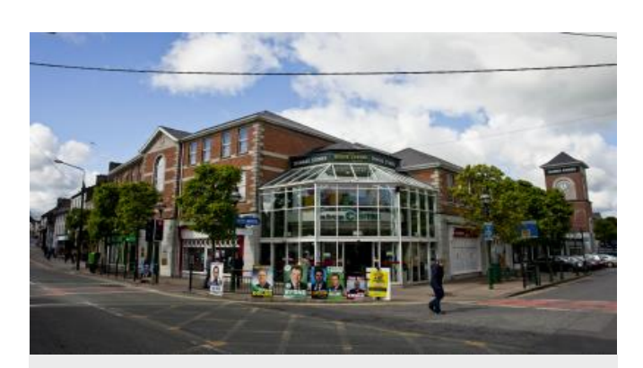
The Bridge Centre, Tullamore, Co. Offaly