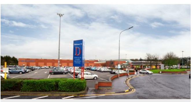
Douglas Court Shopping Centre, Douglas, Co. Cork