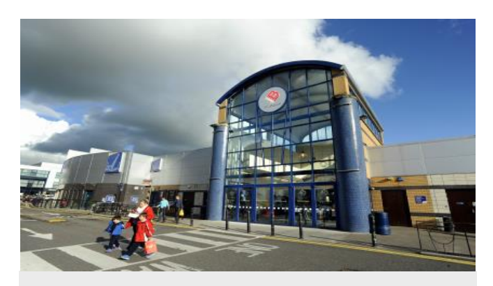
Blackpool Shopping Centre & Retail Park, Cork