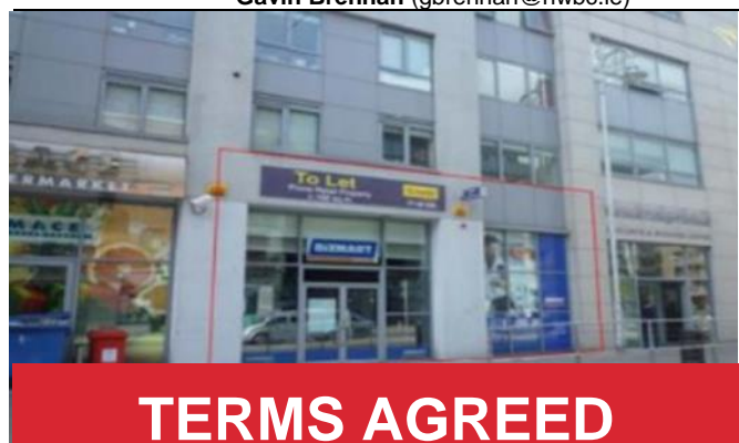
Unit 1, NCI Building, IFSC, Dublin 1

Contact Kieran Curtin (kcurtin@hwbc.ie) Gavin Brennan (gbrennan@hwbc.ie)