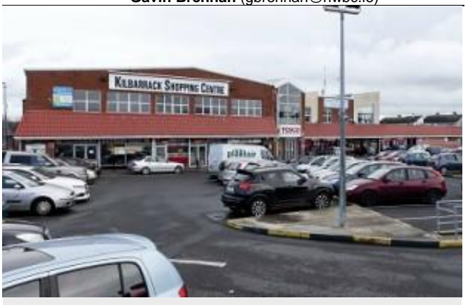
Kilbarrack Shopping Centre, Kilbarrack, Dublin 5

Contact Kieran Curtin (kcurtin@hwbc.ie) Gavin Brennan (gbrennan@hwbc.ie)