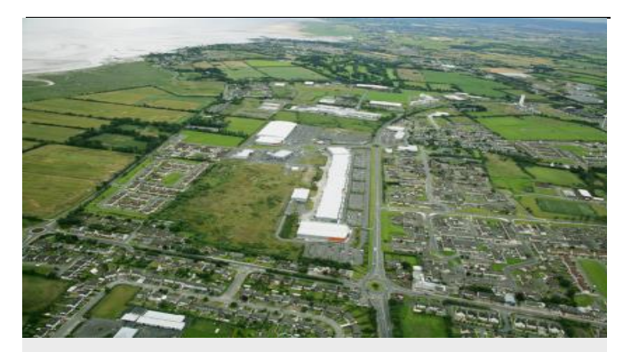
Dundalk Retail Park, Dundalk, Co. Louth