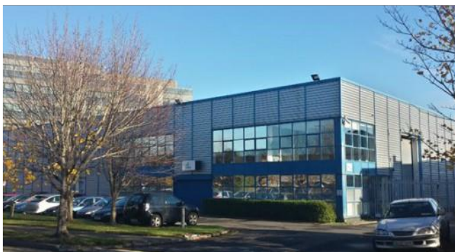
77 Furze Road, Sandyford, Dublin 18