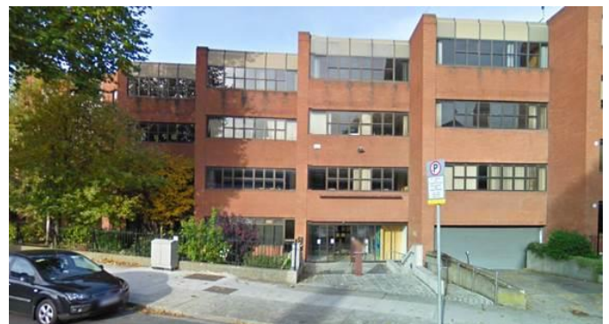
One Haddington Buildings, Haddington Road, Dublin 4