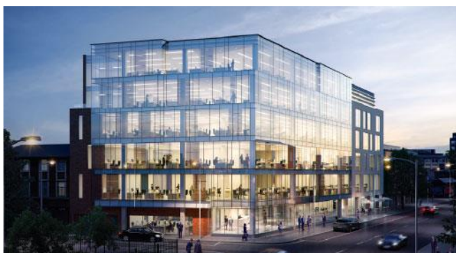
The Sharp Building, Hogan Place, Dublin 2