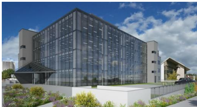
Ballymoss House, Ballymoss Road, Sandyford, Dublin 18