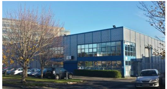
77 Furze Road, Sandyford, Dublin 18